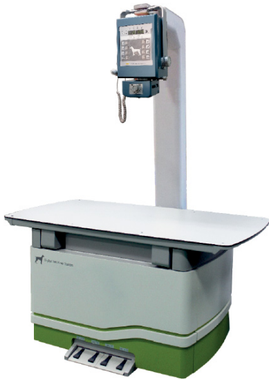
Example Application with Veterinary Table* [ the Table is not provided by EcoRay. ]